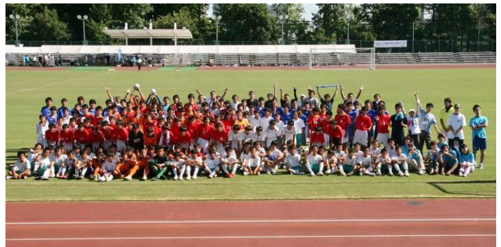
Last day of the event (in Okayama)

Children from Tohoku commented: “I was very happy to be able to play soccer on a beautiful pitch”, “It was wonderful to make new friends”, “I was surprised to know that there is so much sympathy and that there are so many people who care for us”, “I want to find something I can do for other people”, “We were encouraged to do whatever we could toward the recovery of Tohoku.”