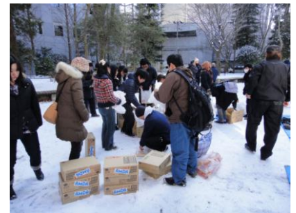
Delivering food in a park in Sendai in January 2012

An increase in the number of homeless has recently become a serious problem in Tohoku. About 100 people in Sendai city are living on the street. After the disaster, these people had come to Sendai to take a job, but as soon as their employment contract expired they were out of work. They became homeless as they couldn't pay for temporary housing and have been taking shelter at Sendai Japan Railway station. To support them survive in the freezing cold weather, AMDA, in collaboration with its donors in Okayama and a local NGO in Sendai, provided them with 300 sleeping bags, 2,000 instant noodles and 2,000 disposable body warmers. Free hot meals were also served in the park. AMDA distributed aid supplies again in mid-March.