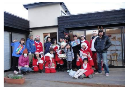
Christmas party for children

The event, entitled “Building a Bond between Otsuchi and Kesen'numa”, was held on 4 th March in Kesen'numa. 54 people in Otsuchi, where AMDA has been working since after the earthquake and tsunami, visited Kesen'numa to perform their traditional drumming, music and dance. And a young people's group in Kesen'numa performed songs. When the “Usuzawa Shishiodori” dancing team from Otsuchi paraded along the shopping street in Kesen'numa, people