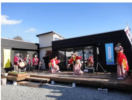
Traditional dance at the opening ceremony