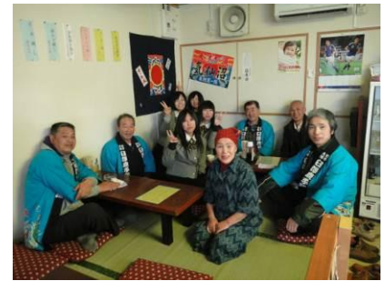
People from Otsuchi and Kesen'numa

People in Kesen'numa told AMDA: "Today I got lots of good energy and encouragement from the people of Otsuchi. I don't want this to be a one-off event", "I immediately felt something in common with people from Otsuchi. I felt tears in my eyes", "Talking with people who experienced the same disaster is consoling", "Next time we want to visit Otsuchi and perform our music and dance." A person in Otsuchi sent a message to AMDA: "It will be great if this bond between Otsuchi and Kesen'numa would expand into whole Tohoku and if people would work together hand in hand. Today was the first step toward this goal."