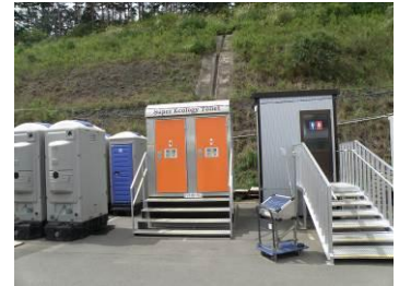
Temporary toilet in Minamisanriku