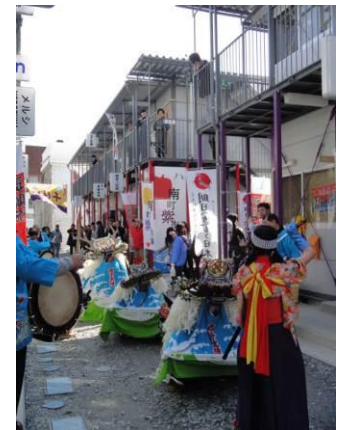
"Usuzawa Shishiodori" parade in Kesen'numa